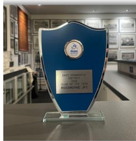
Club of the Year 2022

More than 200 girls and boys registered in 2024. We also played in finals, hosted finals games for the District and showcased our grounds and clubrooms by day and night. The year culminated in Rossmoyne's Year 8 boys team taking out the flag!