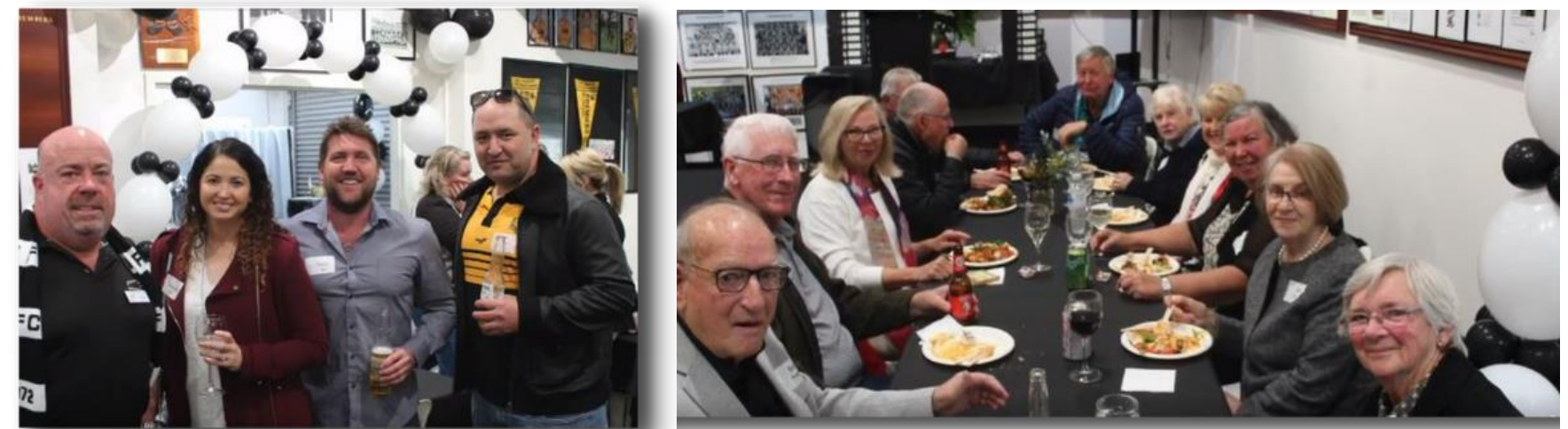
Life Members and Sponsors Luncheon 2022

We look forward to seeing you at the Club and GO RAIDERS!