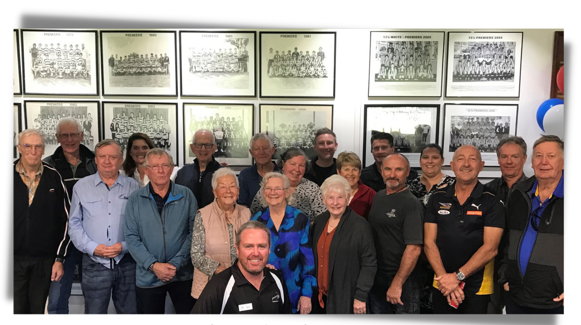
Life Members function 2021

We look forward to celebrating with you in 2022 and GO RAIDERS!